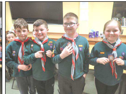
ABOVE: Left, Runners up, 1st Ballyclare and RIGHT: 3rd placed 4th Carrickfergus.