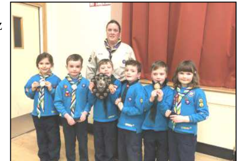
Above: Beaver Quiz winners. See text.

We had five very competitive, enthusiastic teams made up from seven colonies from the District..1st Ballyclare, 1st Ballygally, 1st Carrickfergus, 4th Carrickfergus, 1st Cloughfern, 1st Islandmagee and 1st Whitehouse.