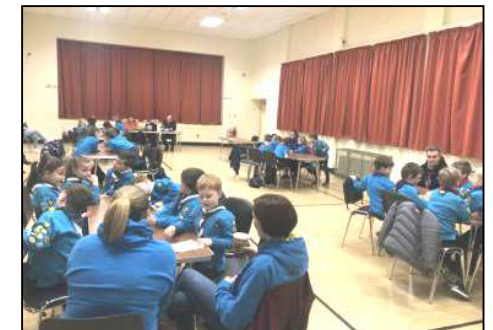
Above: Beaver Quiz views.