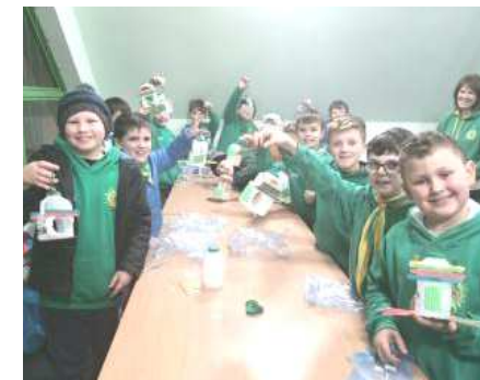
BELOW: 1st Carnfunnock Cub constructing bird feeding houses.