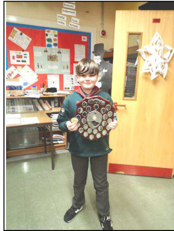
ABOVE: District Cub Quiz Trophy

First off, congratulations to 1st Whitehouse for winning the District Quiz. See this month's cover, photograph right and on page 5 of this edition. They will be joined by 1st Ballyclare and 4th Carrickfergus at the County Quiz.