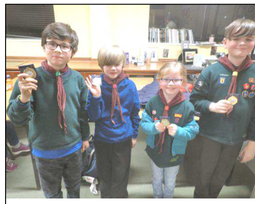
ABOVE: 1st Whitehouse, winners of the District Cub Quiz.